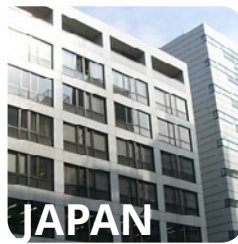
JP | Tokyo