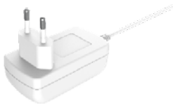
PMA18E-120PHW-R Dimension L82xW43.2xH30mm