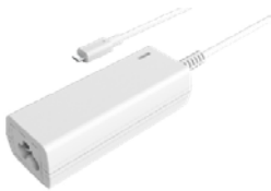
MM18M-59A-R (USB-B, with QC 2.0)