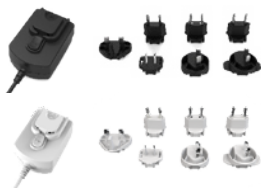
PMA10R-050A-R PMA10R-050AW-R Dimension L71.7xW50xH40mm