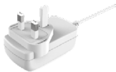
PMA18K-120PHW-R Dimension L82xW43.2xH30mm