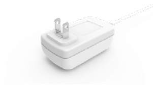
PMA18A-120PHW-R Dimension L82xW43.2xH30mm