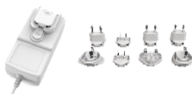
PMA36R-120B-R Dimension L106.5xW51.5xH38.5mm