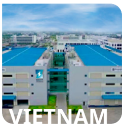
VT | Hai Phong