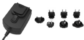
PMA10R-240A-R Dimension L71.7xW50xH40mm