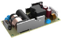
MA060-240C-R Dimension L101.6xW50.8mm