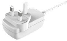
PMA18K-240-R Dimension L82xW43.2xH30mm