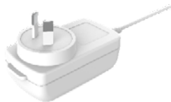
PMA18S-120PHW-R Dimension L82xW43.2xH30mm