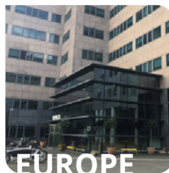
EU | Amsterdam