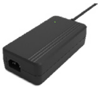
MA100X-240B-R (X=U type)