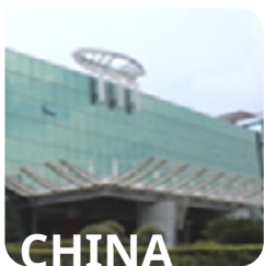
CN | Jiangxi, Dongguan