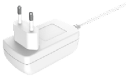
PMA18E-120-R Dimension L82xW43.2xH30mm